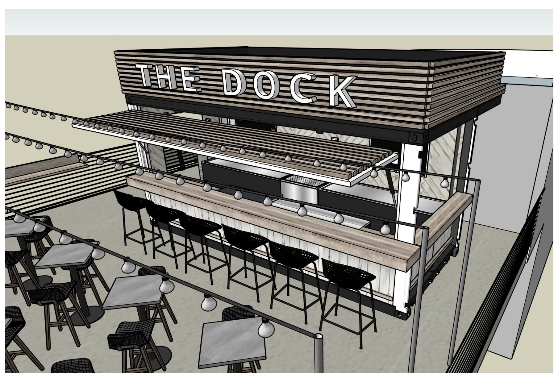
East and west sides of the bar structure shall have this same horizontal wood detailing as the north side.