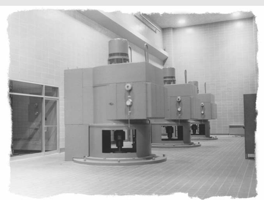
New pumps at North Point Station, 1964.

By 1960, North Point Station was becoming too costly to operate. The entire station was taken down and replaced by a new building and pumps in 1963.